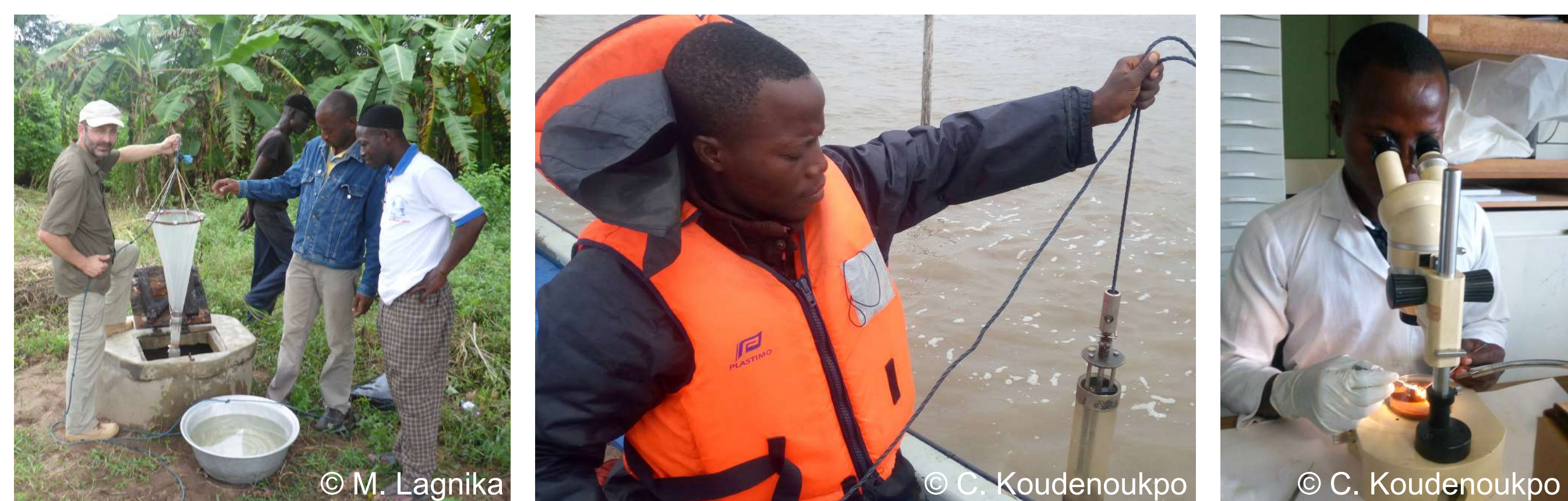
(CEBioS, Royal Belgian Institute of Natural Sciences, Université Abomey-Calavi, Institut de Recherches Halieuthiques et Océanologiques du Benin)

The GTI has supported several PhDs of Université Abomey-Calavi on the biomonitoring of macroinvertebrates of Lake Ahémé and on groundwater fauna as indicators of water quality in Benin. The GTI has funded several short-term trainings from other African countries on water related taxonomical issues. Furthermore, CEBioS supports IRHOB for modelling currents in the ocean and the Cotonou lagoon using the COHERENS model in order to understand erosion processes and dispersal of shrimp larvae (for aquaculture). (With the support of Bio-Bridge)